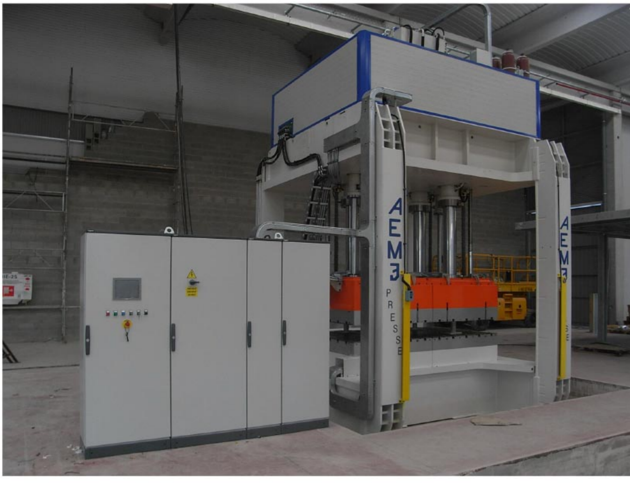
Automotive production press in Spain

Let me introduce some special hydraulic systems built by us, visit our website to see our productions