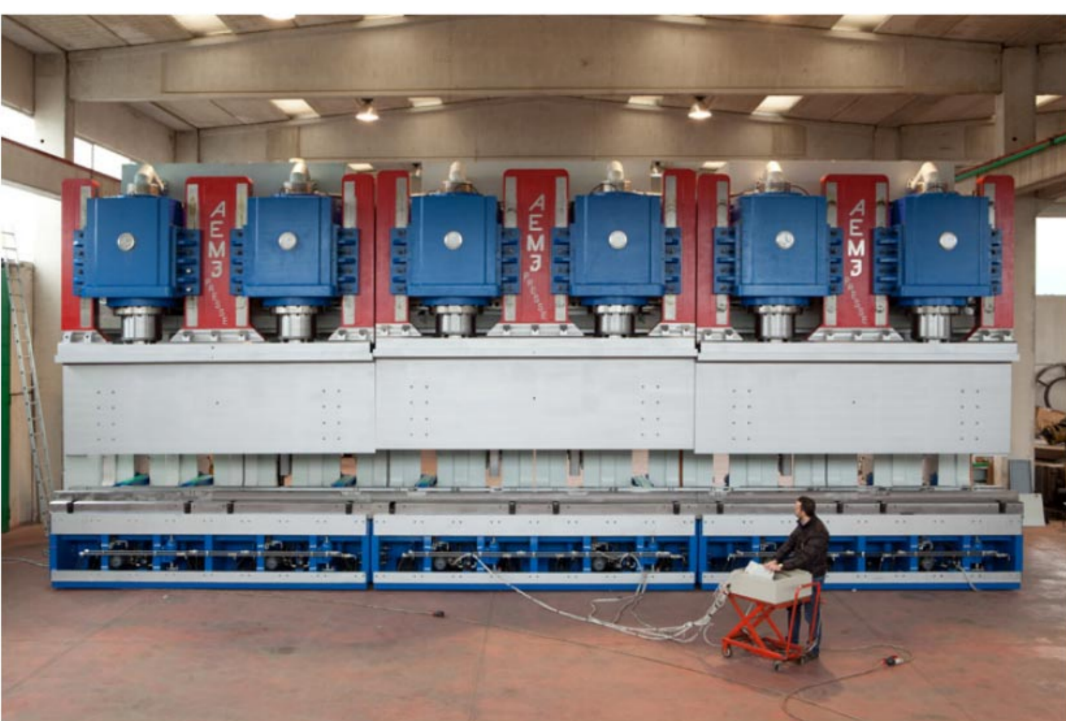
Press power 4200 Tonn for production oil&gas pipe in Italy