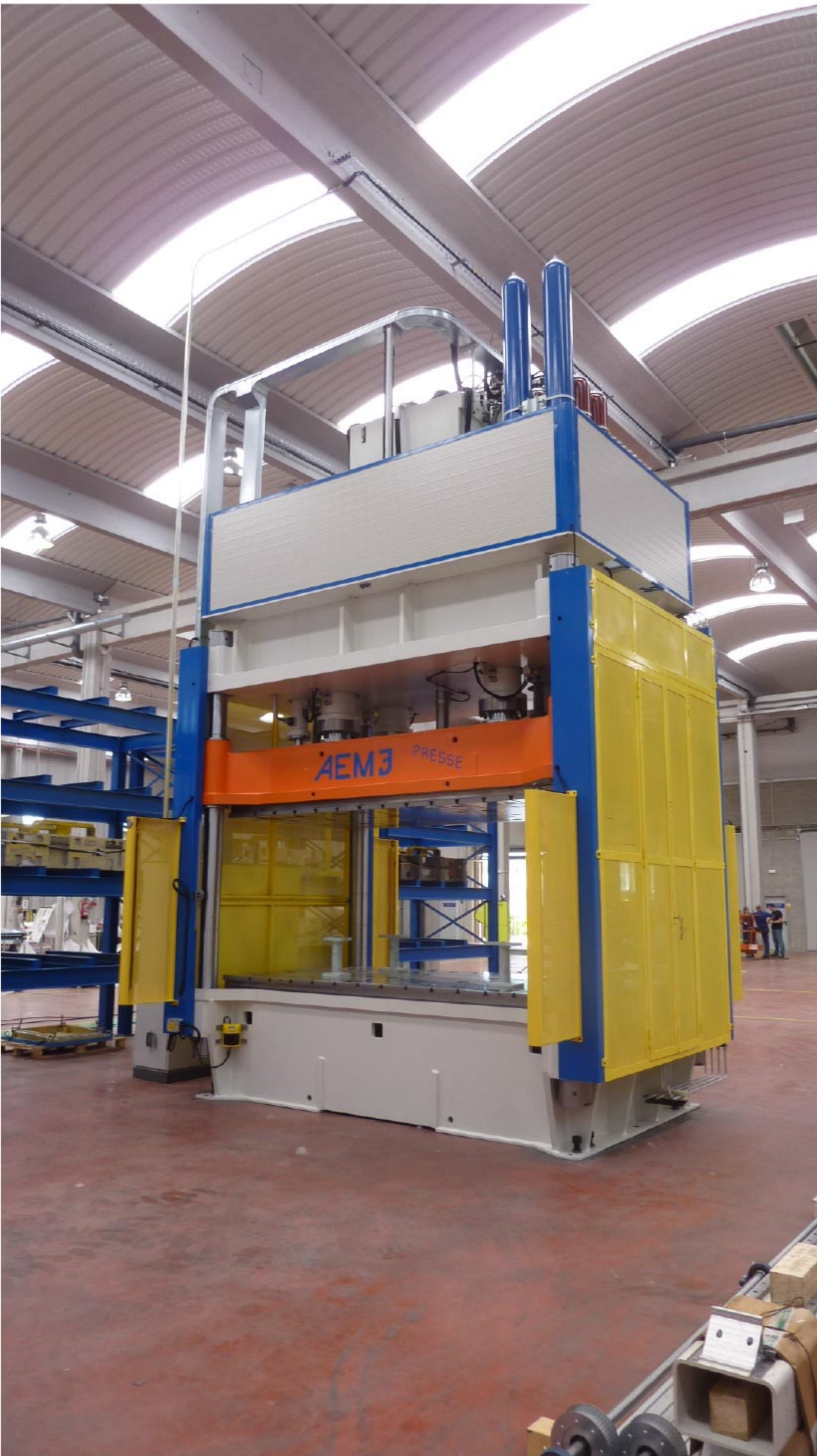
Automotive production press in Poland