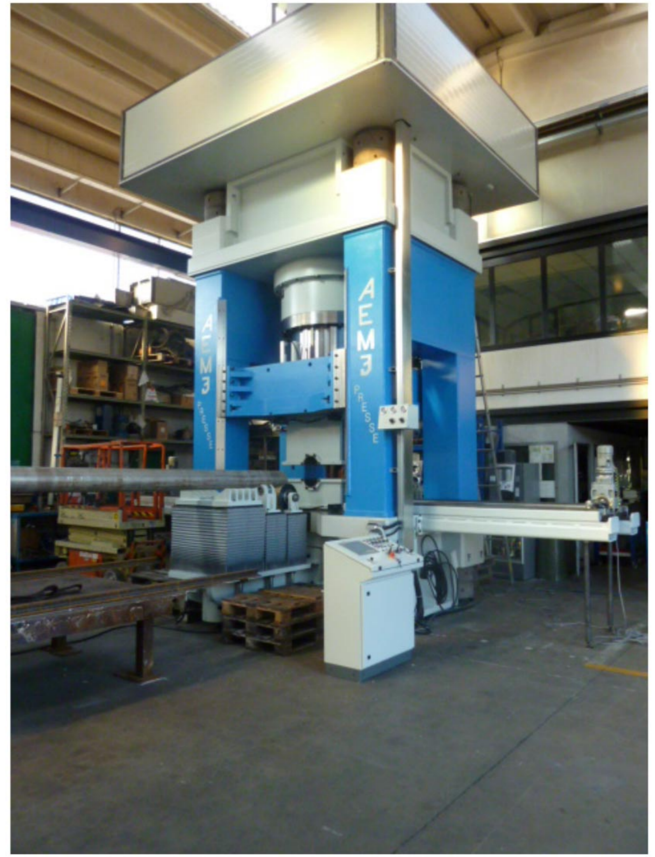
Press power 3000 Tonn for production oil&gas pipe in Germany