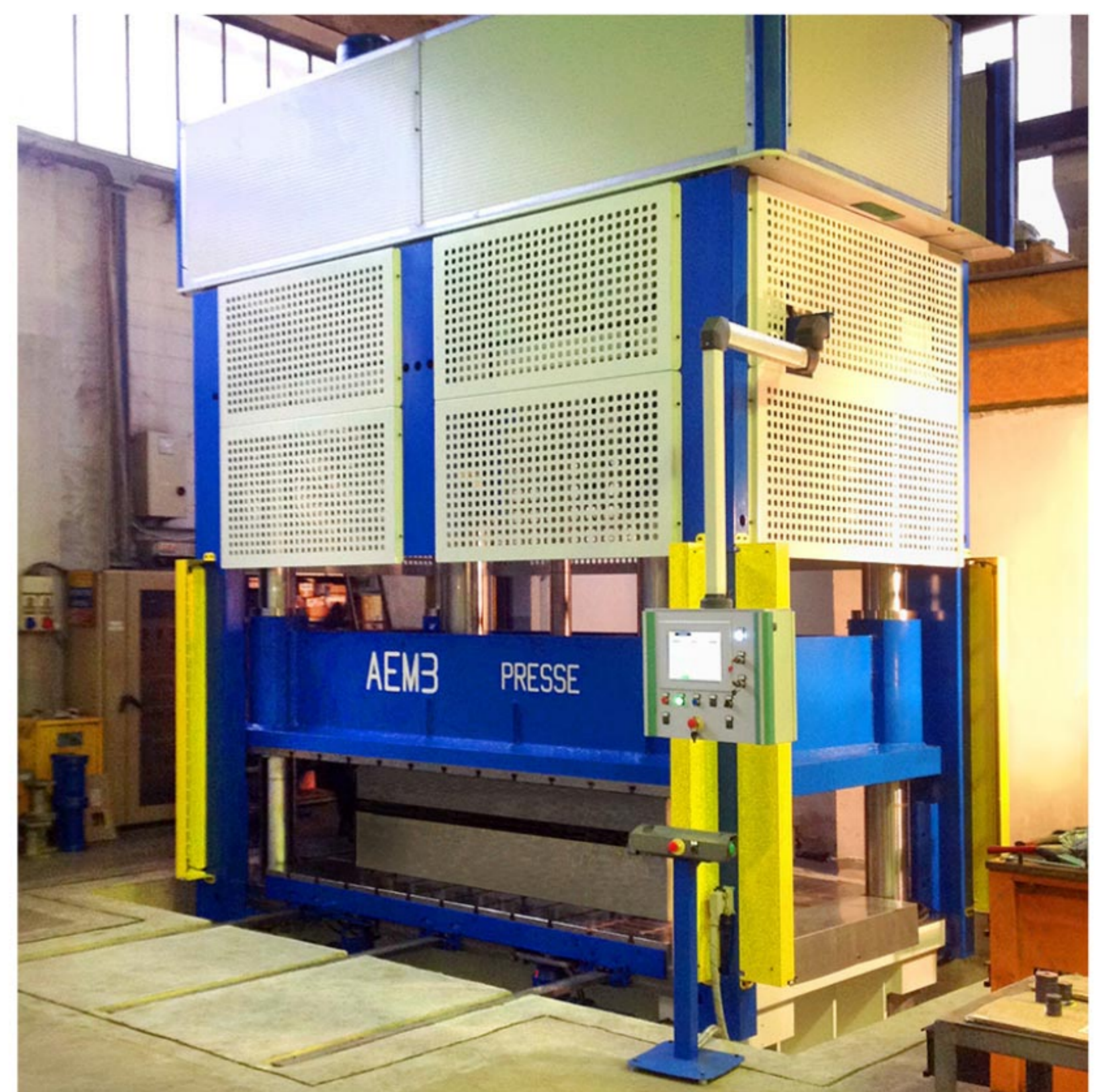
Press testing molds in Italy

Contact us tel. +39.035.4423562 maffimichael@aem3.it