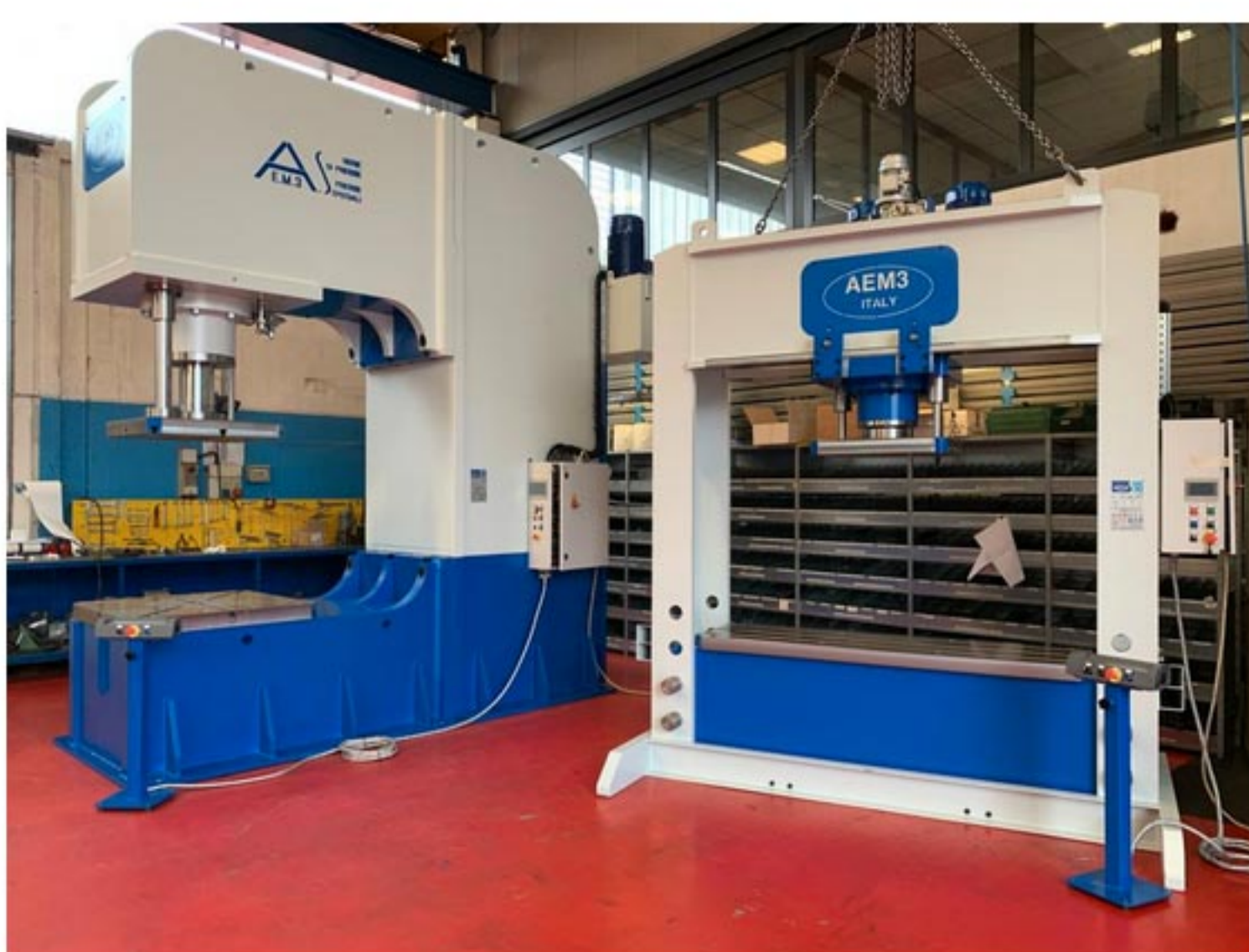
GOOSENECK PRESS POWER 200 TONS